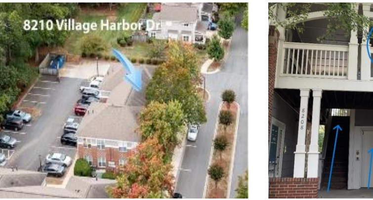
PLEASE USE STAIRS OR ELEVATOR